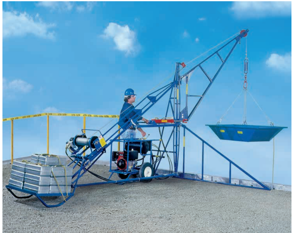
HS1000 with 400lb trash tray

*Optional Upper Limit Switch for anti-two blocking on HS2000.