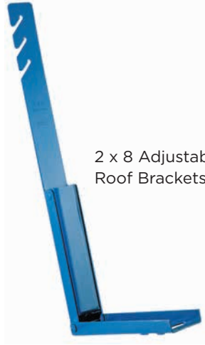
2 x 8 Adjustable Roof Brackets