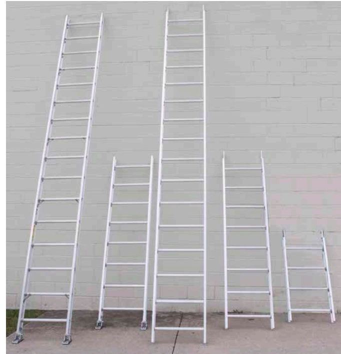
Base Unit with feet