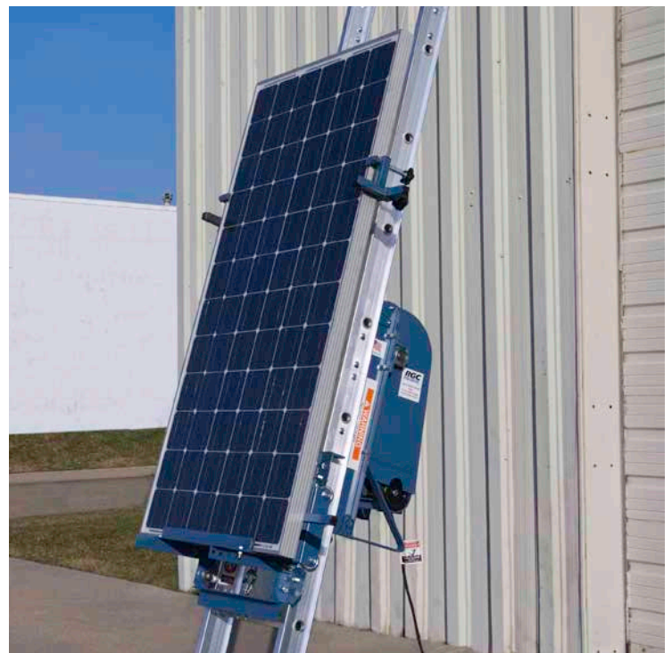
Solar Panel Carrier Attachment