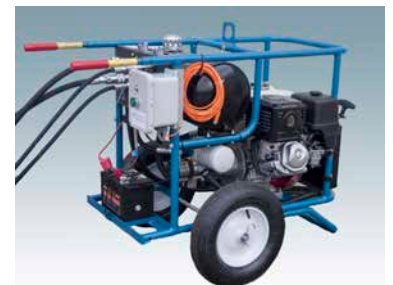
The easy to maneuver HH1358S HydraPak features an optional safety valve for limit switch to prevent over-raising materials.