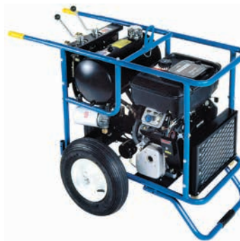
HV1658S HydraPak Shown without limit switch valve.