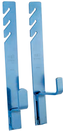
2 x 4 Narrow and 2 x 4 Wide Shinglers