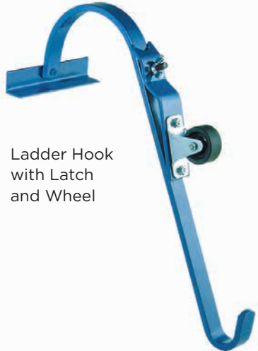
Ladder Hook with Latch and Wheel