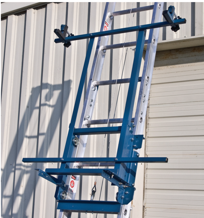
Solar Panel Carrier Attachment